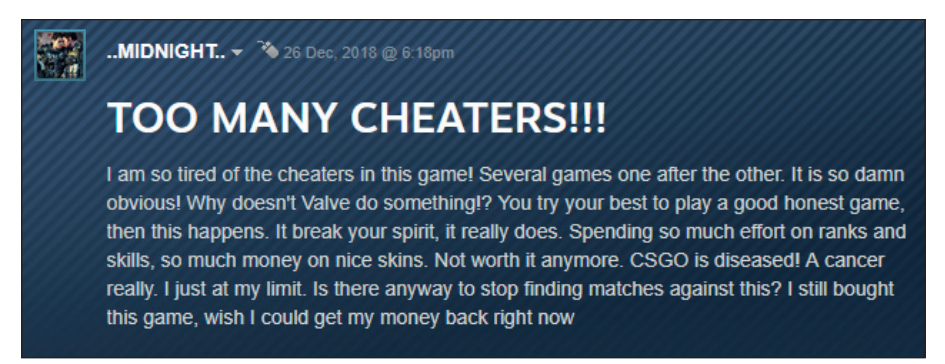
Figure 3: Communities are riddled with messages complaining about the number of cheaters increasing and ruining the game for players and the reputation of the developers [12].

Liberty . Both games are still played competitively to this day for prizes that average half a million dollars per tournament [11].