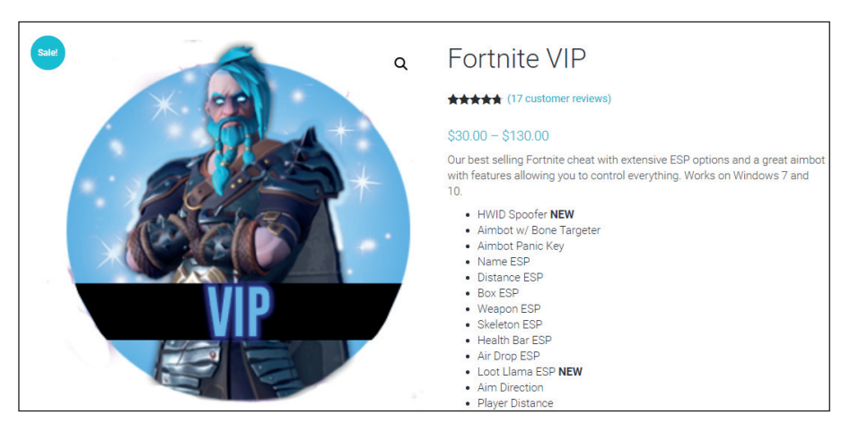
Figure 2: Depending on the game and how customized the cheat is, the price could easily exceed the original cost of the game.

banned accounts were paid accounts, and some had over 1,500 hours of gameplay on them. Moreover, the company estimated that 'the revenue that the three main cheat-makers had been generating was between $15,000 and $50,000 per month each, with users spending $30 per month on hacks.' [9].