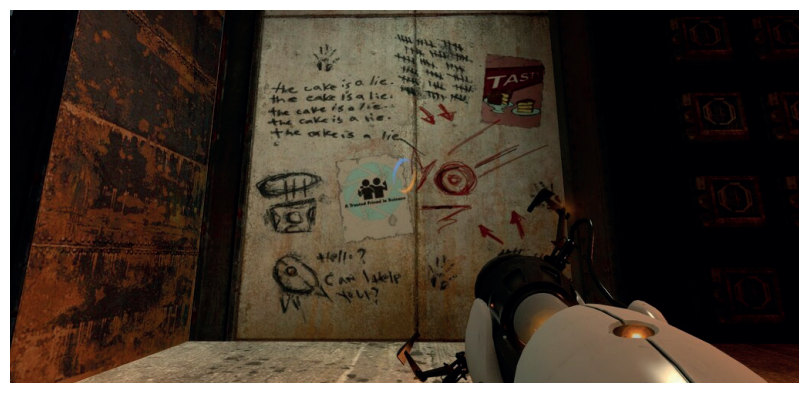
Figure 6: 'The cake is a lie.' In the game Portal 2, an Easter egg shows that the promised reward sometimes is only used as a motivation and is not real. The essence of behavioural game design distilled in a simple phrase.

The level of engagement and interest a user will demonstrate in a game, although variable, is not random. Extensive studies on the functioning of variable rewards systems measure how often a player should receive some form of stimulus from the game. As with the now moderately infamous 'Skinner Box' [20], video games use the same principles for creating compelling and addictive environments that players can't resist. Considerable effort goes into designing levels, characters, and a reward system that will keep players on the edge of their seats for uncountable hours. However, when cheaters are factored into this delicate equation, we can begin to observe how the activity interferes with the level of enjoyment other players experience, thus converting the game into an activity that's not fun anymore. And when players stop playing, and online communities become toxic, a whole industry, and the jobs that depend on it, suffer.