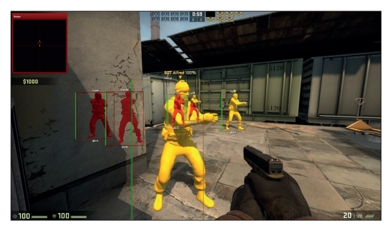
Figure 4: A wallhack and aimbot from a cheat provider that sells time-based subscriptions for different games. A monthly subscription can start at around US$20, rising to US$100 for a lifetime membership.

When considering the network architecture of online games, some elements have to be handled by the client to speed up processing and reduce the lag between when an action is sent to the server and when a response is received and rendered on the display. This leaves the door open to client-side cheating, where the player can modify game files, memory variables, or even use different graphic card drivers to reveal information that was previously hidden by the game client. Such is the case with wallhack or ESP (extra sensory perception) cheats, in which the player is able to see opponents through walls, exhibiting god-like abilities simply by having more information to hand than other players.