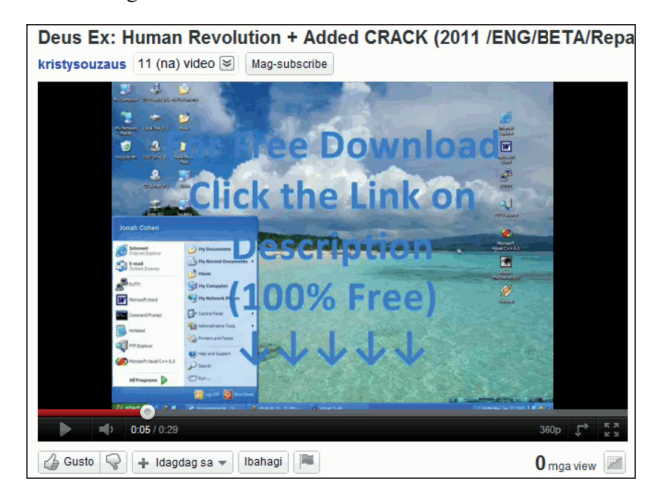
Figure 5: Fake ad blocker.

Unfortunately, many of these files turn out to be fake or malicious, which opens the computer up to malware, data theft, survey scams, or in particularly ironic cases, additional advertising.