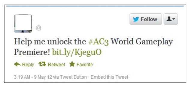
Figure 6: Ubisoft campaign.

Another successful campaign from the same year was put together by Ubisoft , who had gamers 'unlock' a videogame trailer for Assassin's Creed 3 by posting messages advertising the game on social media channels such as Twitter . Clearly, this makes little sense – the trailer would always have been released, whether gamers sent endless Retweets or not.