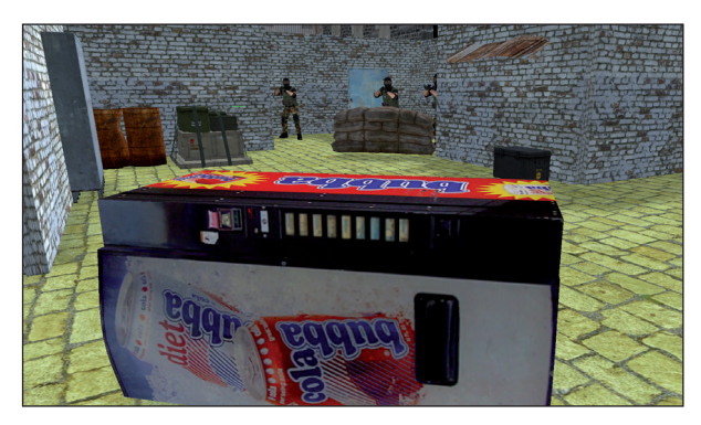
Figure 2: Overturned vending machine displaying brand logo.

machines may be used as the sole source of cover in exposed areas, with the player popping out of cover from behind an advert. By the end of a shootout, the player may have physically stood up then crouched behind a brand logo 30 or more times without realizing it.