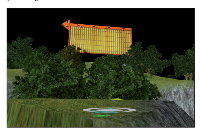
Figure 3: Billboard.

As another example, players might be made to walk up a steep hill, at the top of which is a large, inescapable billboard promoting a brand.