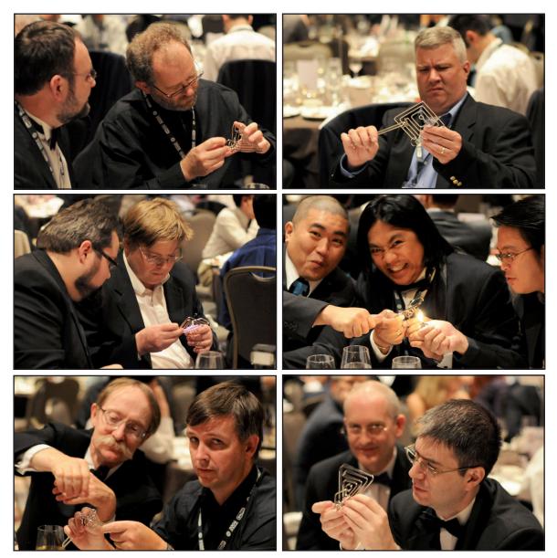
'Brain power alone is the key to success.'

according the puzzles' manufacturer, 'brain power alone is the key to success'.